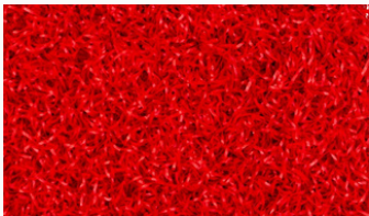
0905 APPLE RED