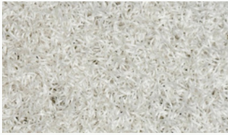
0909 WINTER WHITE