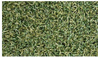
0902 SOLID GREEN