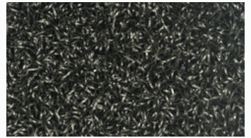
0910 RAVEN BLACK