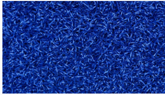
0904 INDIGO BLUE